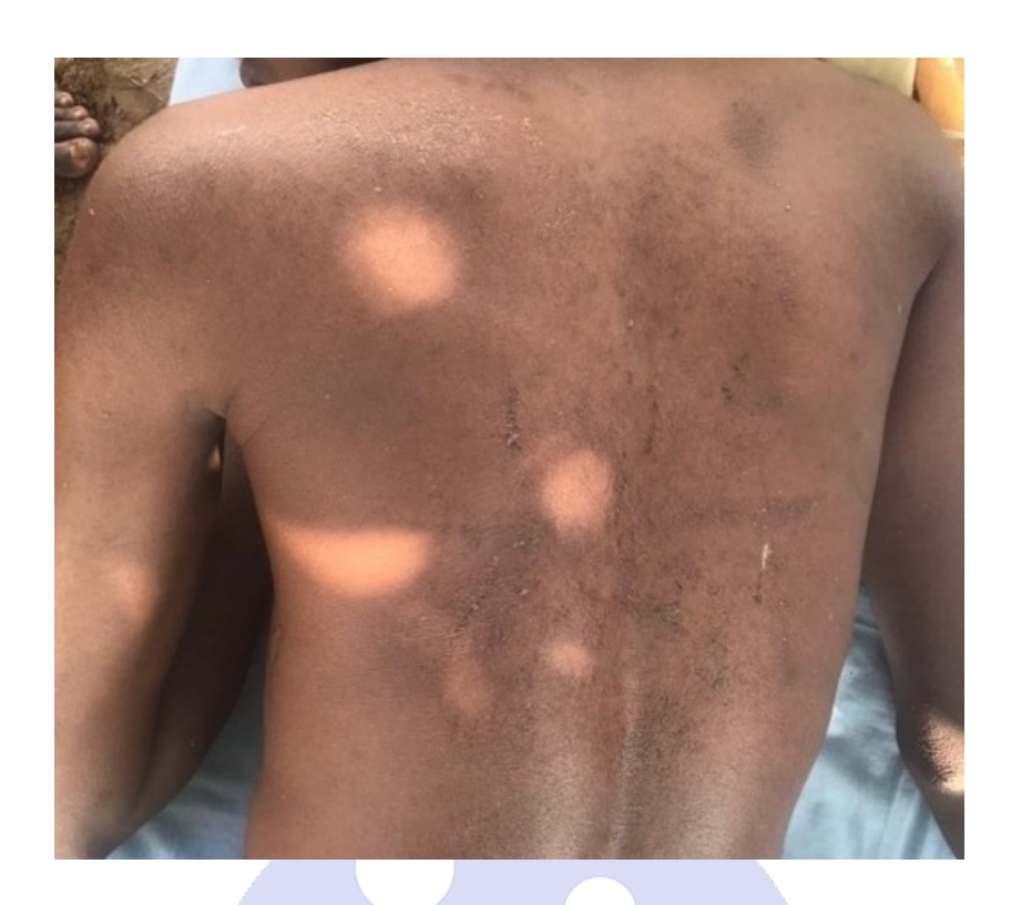
(marks of hot iron and beatings)