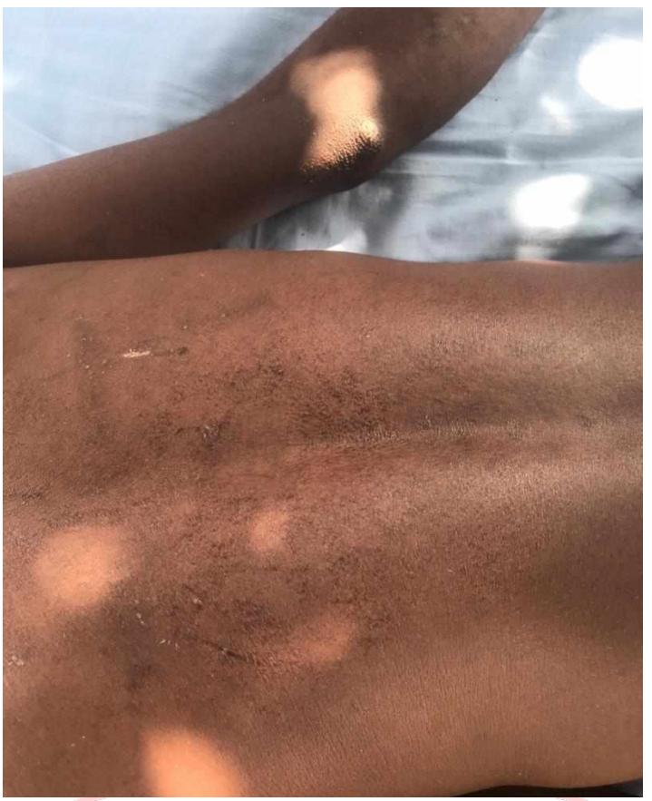
(Marks of hot iron and beatings)

such as "you are a slave," "illegitimate child," and "you have to follow us as a slave." They even melted plastics and dropped droplets on his body. There was a severe lack of food in detention, with RSF soldiers providing remnants of what they had eaten – sometimes once a day or once in two days. He also witnessed the rape and death of both men and women by the RSF during his time in detention.