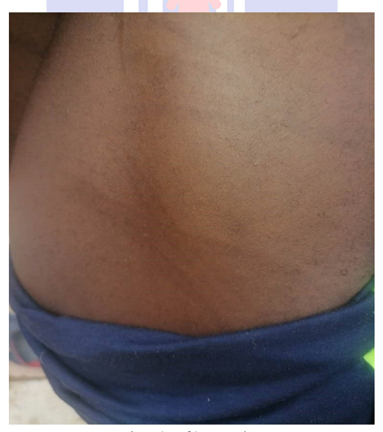
(Marks of beating)

The first incident of torture for Baher occurred on the first day of detention. RSF took him to a separate interrogation room and beat him with whips, sticks, and gun buttocks. Sometimes, RSF used to torture him three times a day. RSF used to take people from Al Fashir to the interrogation room, as during that time, RSF wasn't in control of any part of Al Fashir. Currently, Al Fashir is controlled by three raging factions: the north of Al Fashir is controlled by RSF, the west by the SAF, and the central by the Juba Peace Agreement group, which comprises a coalition of Sudan Liberation Movement, Sudan Liberation Movement- Minni Minnawi, Sudanese Alliance, and Justice Equality Movement. So, at that time, as per RSF, all the people of Al Fashir were supporters of or worked for SAF.