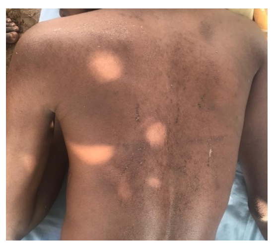
(Marks of hot iron and beatings)

The RSF soldiers primarily spoke Arabic and French, and the survivor claims to have seen Russian mercenaries entering and leaving the detention campus in their tundra cars. RSF also collected data on all detainees. As a result of the beatings, he lost five teeth. After escaping captivity, a medical examination revealed that his back tissue was broken.