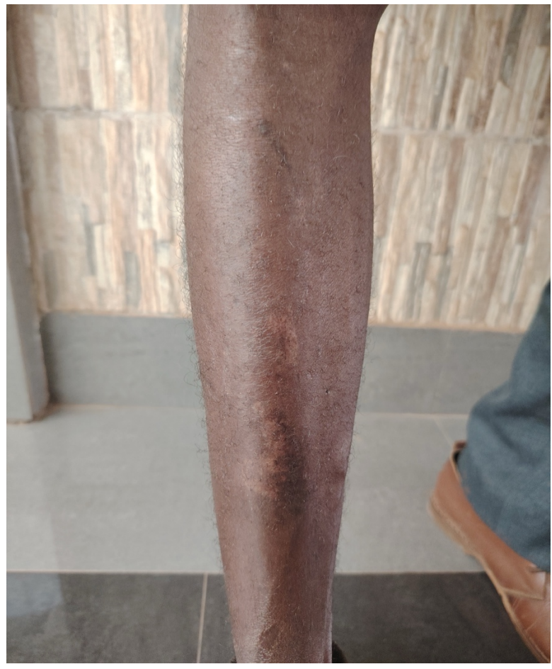
(marks of beating)

"In Sudan, after practising for ten years, a lawyer earns a special stamp; I had just obtained mine, and now it's gone."